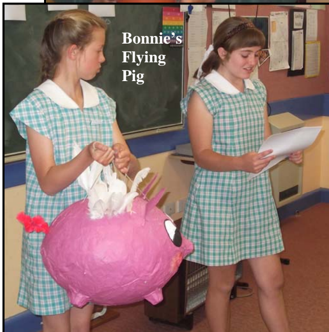
Bonnie's Flying Pig