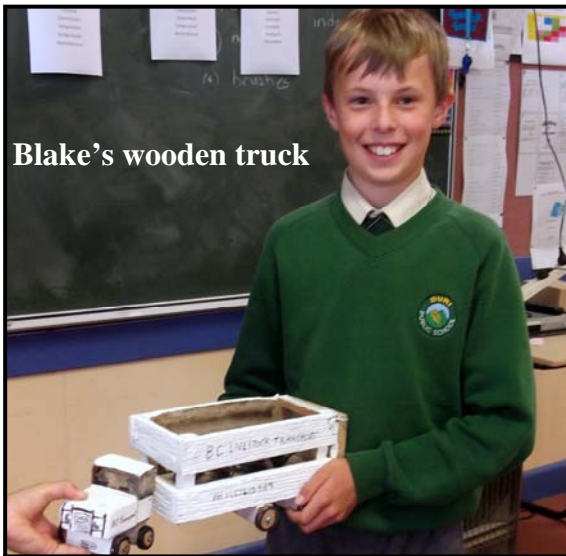
Blake's wooden truck