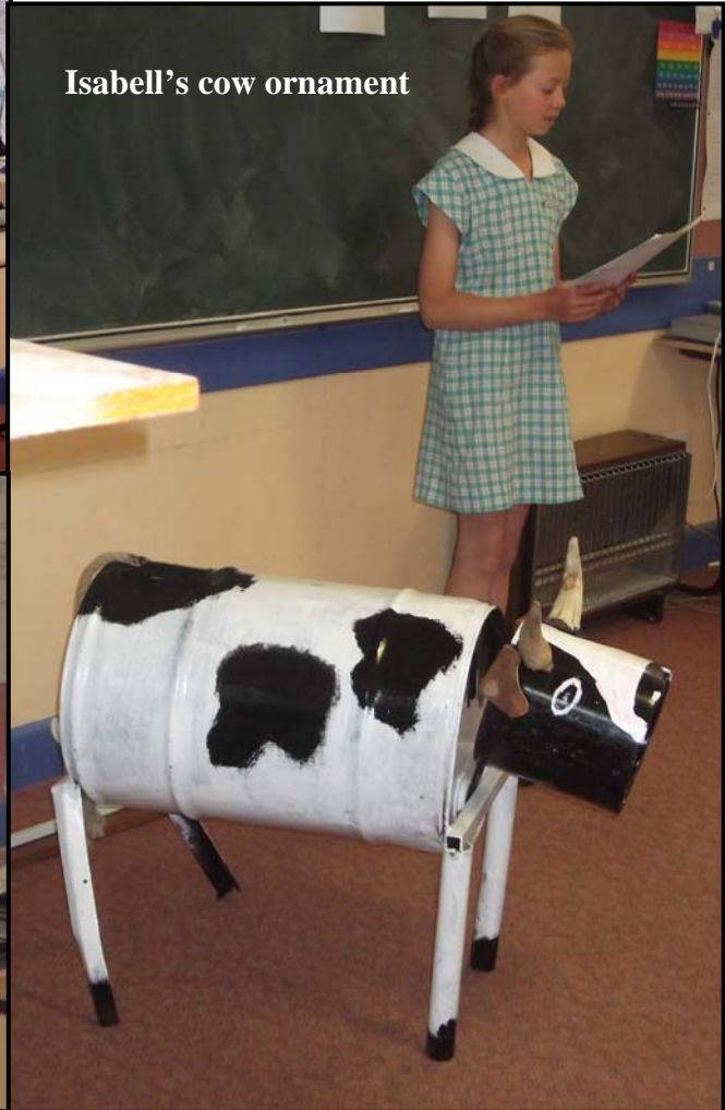
Isabell's cow ornament