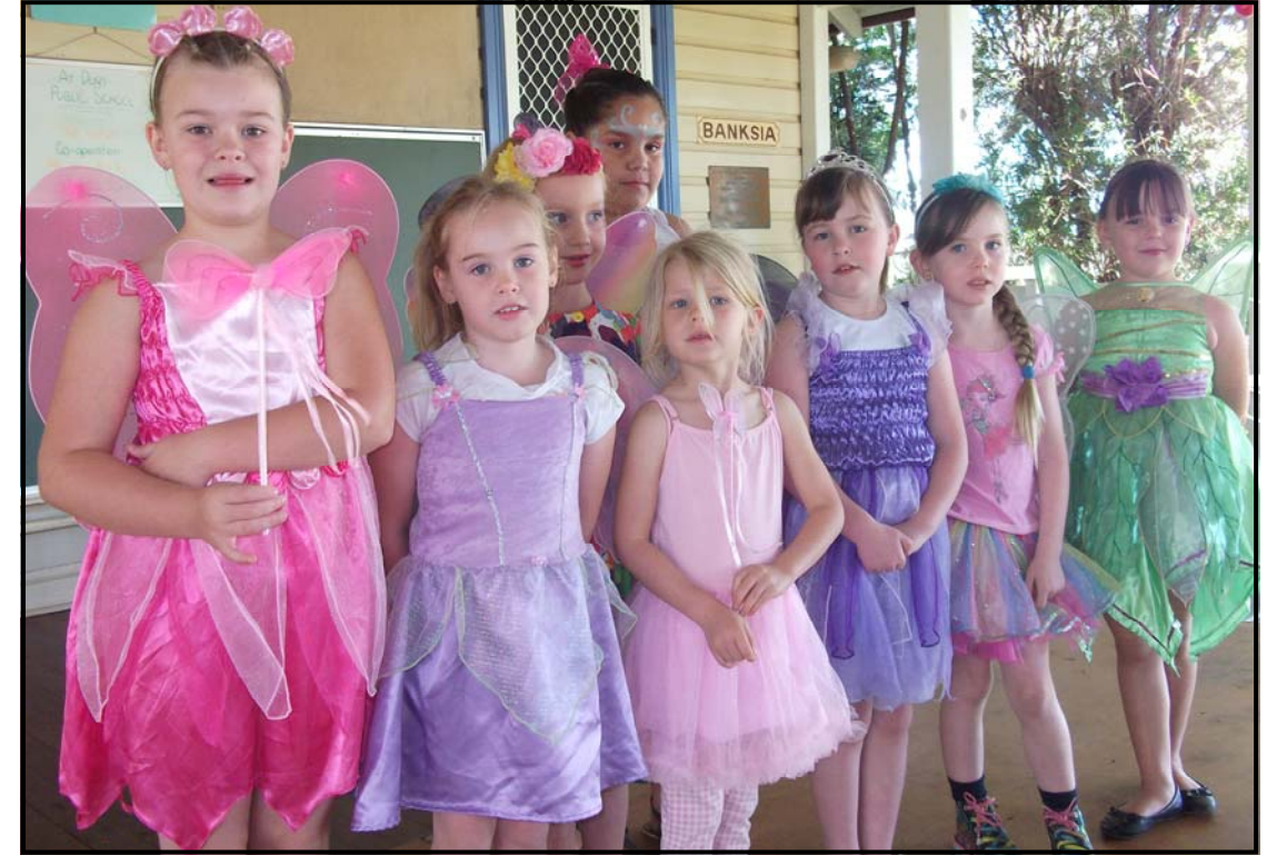
Duri Public School - Tolerance, Self Discipline, Independence