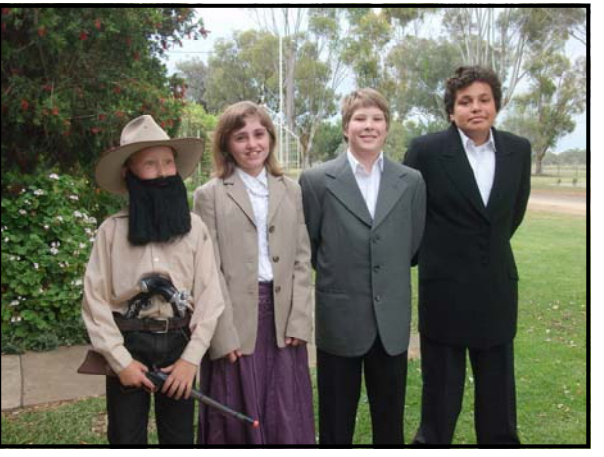
A Collection of Notables