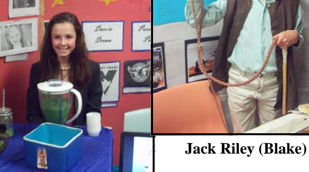
Layne Beachley (Charlotte K)