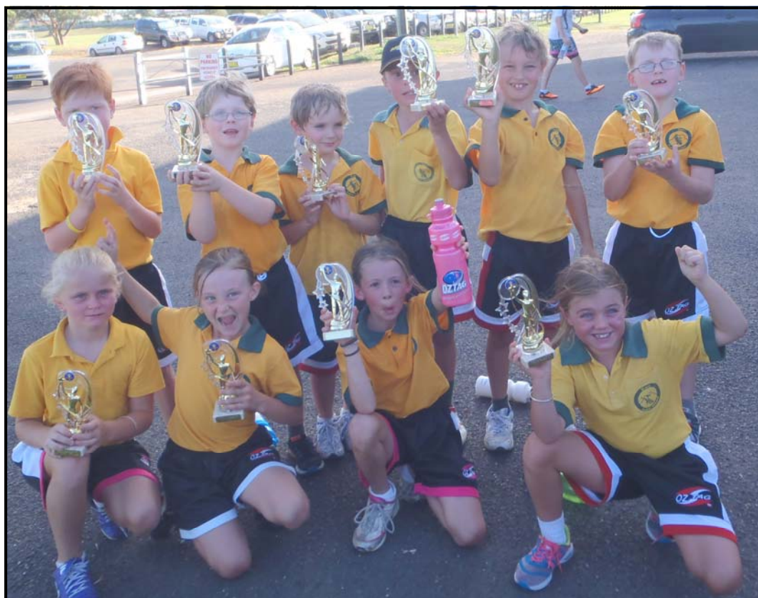
2013 Junior OzTag Winners in Under 8 Division

Duri Public School - Tolerance, Self Discipline, Independence