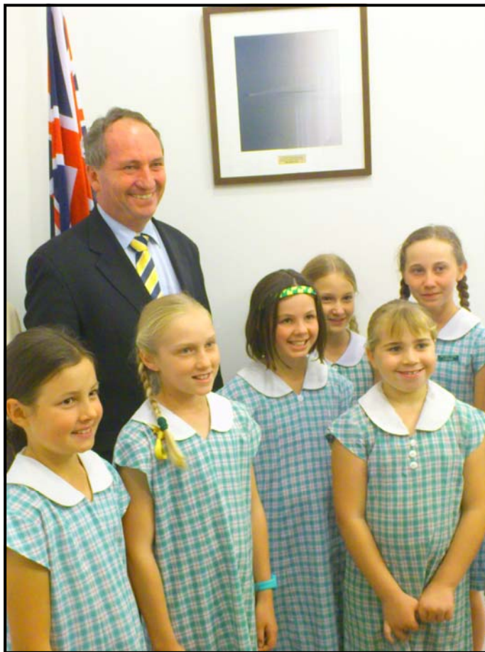
Barnaby Joyce in his office with Duri students

When we visit the nursing home we take gifts for the residents such as toiletries, hankies, writing paper etc. If you assist by providing a small gift, it would be appreciated. More information and permission note to go out shortly.