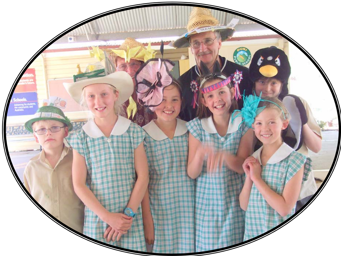
Fashions in the Field

Duri Public School - Tolerance, Self Discipline, Independence