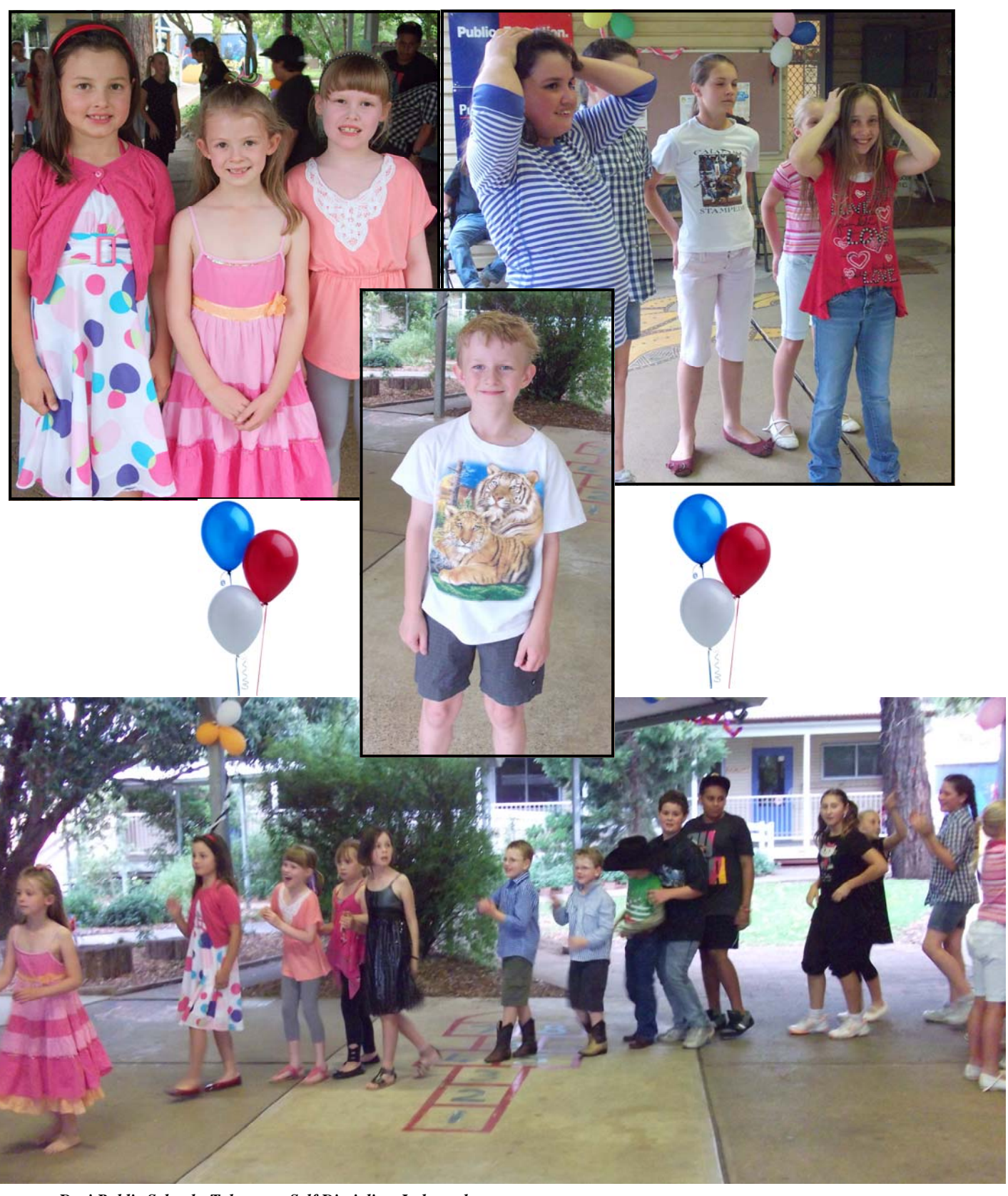
{\it Duri\ Public\ School\ -\ Tolerance,\ Self\ Discipline,\ Independence}