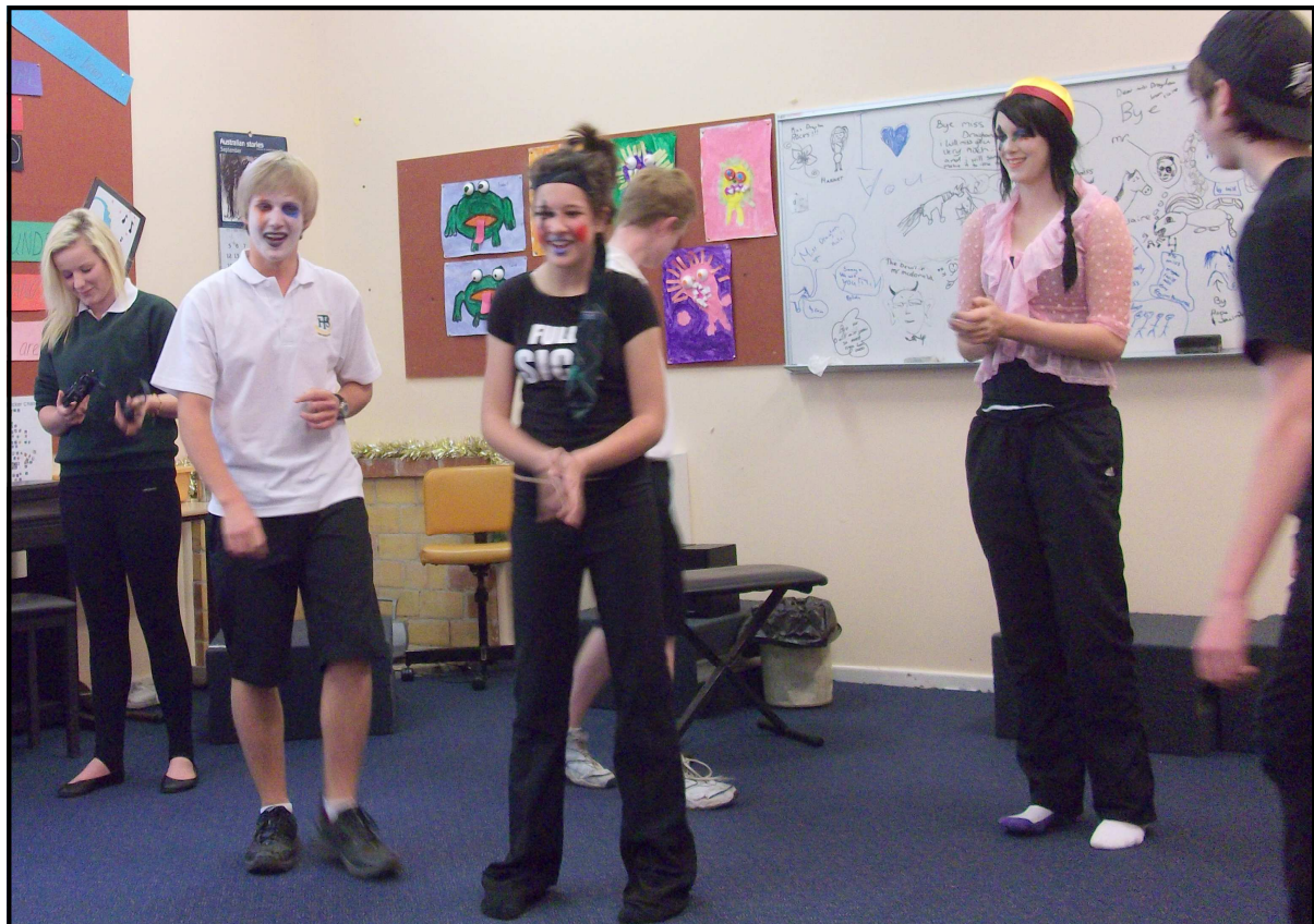
Some of the Peel High School Drama students that performed for us on Monday.