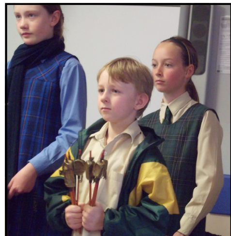
Duri Public School - Tolerance, Self Discipline, Independence