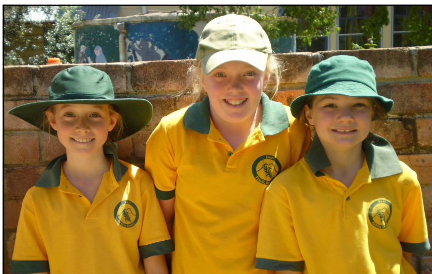
Duri Public School - Tolerance, Self Discipline, Independence